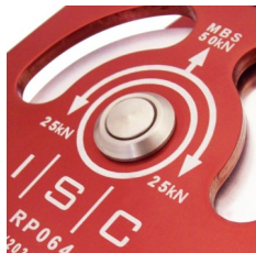
Bushings Ideal for high loads at low speed