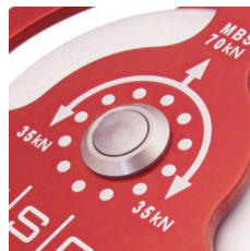
Roller Bearings Ideal for low loads at high speed

ISC Prussik Pulleys have tamper-proof Rivets, in compliance with CE EN12278 (2007) & NFPA (1983). These pulleys are available with Bushings, or Roller Bearings.